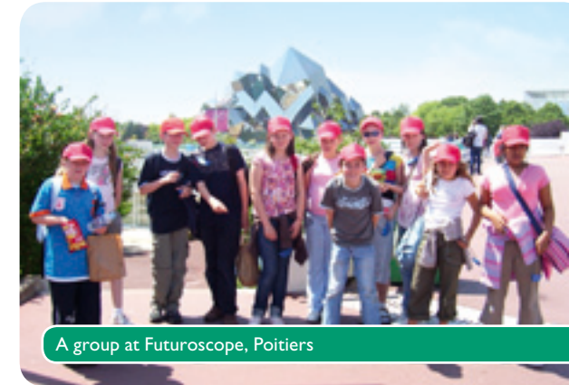
A group at Futuroscope, Poitiers

Please see details about our Preview Visits for teachers on page 10.