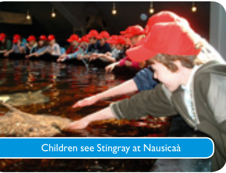
Children see Stingray at Nausicaä

In response to demand, we have expanded our range of educational tours to France to include short, discounted tours during the off peak season (November to February inclusive).