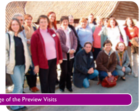
Groups taking advantage of the Preview Visits

“ The visits to all 5 youth centres were of immense value. The visits were very informative and they allowed teachers to complete their risk assessment paperwork while sharing ideas with like-minded colleagues ”