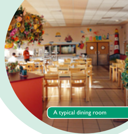
A typical dining room

This part of France has close associations with Britain. William the Conqueror set off from this area to conquer Britain in 1066. You can visit the charming little town of Bayeux and see the magnificent tapestry describing the Norman Conquest. Nearer to our own time, the allied Normandy landings started here in 1944. The residential centres are well situated for visits to the Normandy beaches and the Caen Memorial Museum of Peace. Rouen in Upper Normandy is also well worth considering as it is only 2 hours from the Eurotunnel.